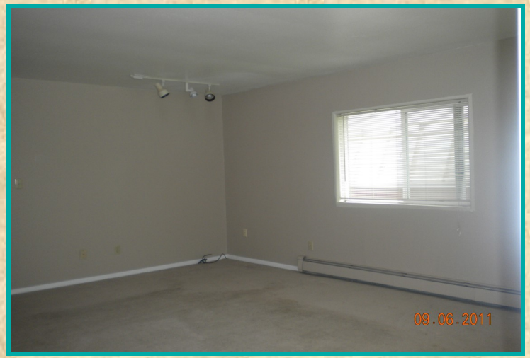
Living Room & Kitchen