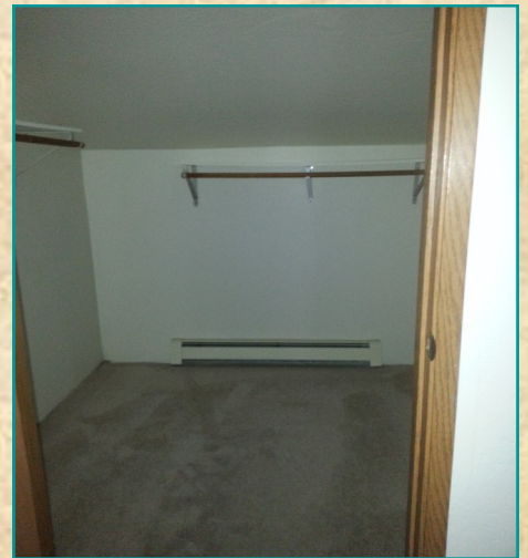
Big Walk In Closet Additional Linen Closet in Hallway